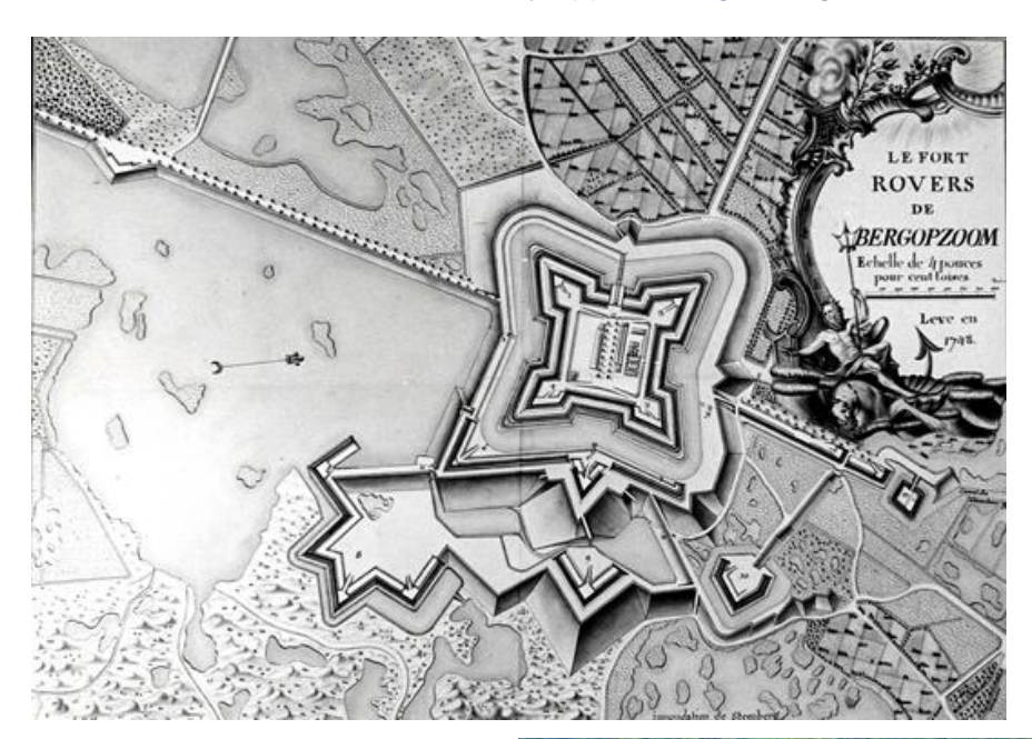
Original plan of the fortress.

Aerial view of the fortress during restoration in 2010.