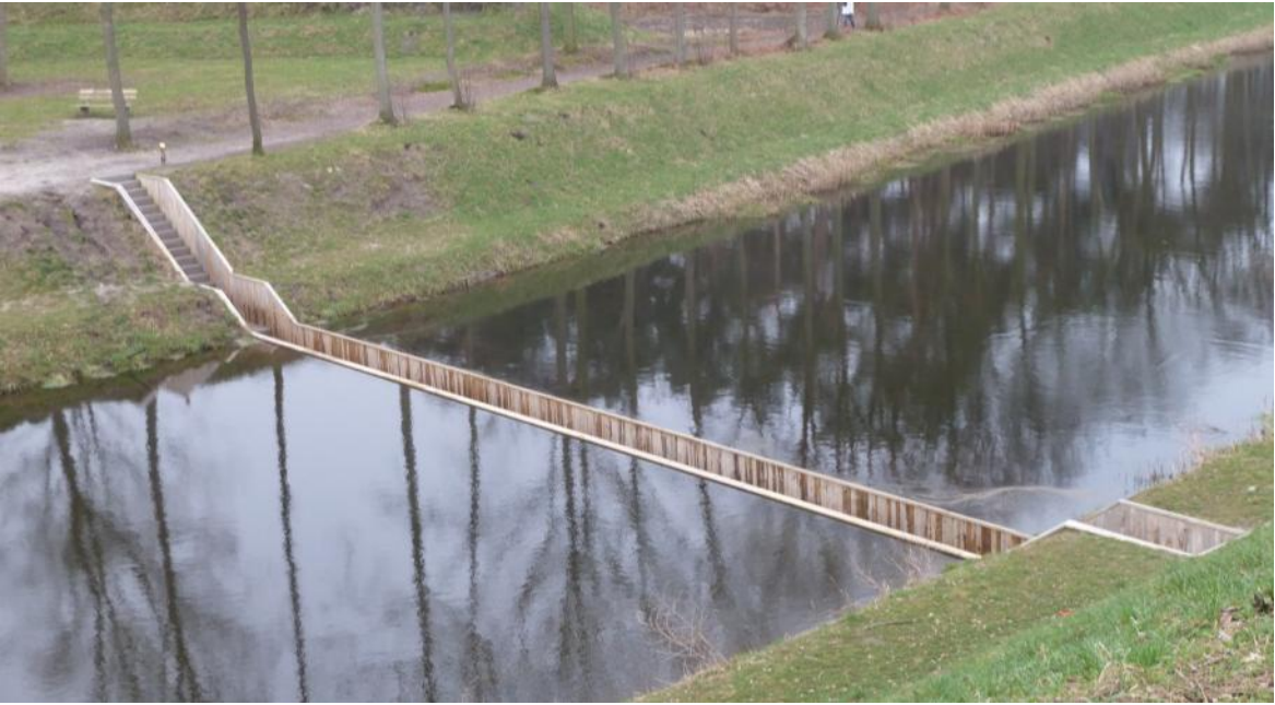
More on this fortress can be found on the excellent website devoted to the defense works: <a href="http://www.westbrabantsewaterlinie.nl/">http://www.westbrabantsewaterlinie.nl/</a> Unfortunately in Dutch only.